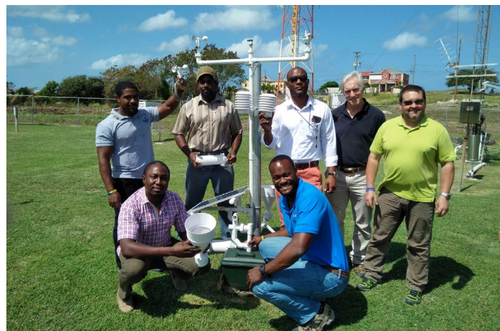
Members of the BMS and COMET ICDP with one of the first 3D-PAWS in Barbados.

Just a few weeks later, on July 2, BMS forecasters were able to monitor increasing winds on the island from Hurricane Elsa, the first hurricane of the 2021 season. The northern eyewall impacted the southern portion of the island, causing structural damage, but no loss of life. The peak wind observations from the 3D-PAWS helped the BMS quickly direct first responders to the areas that sustained the most damage.