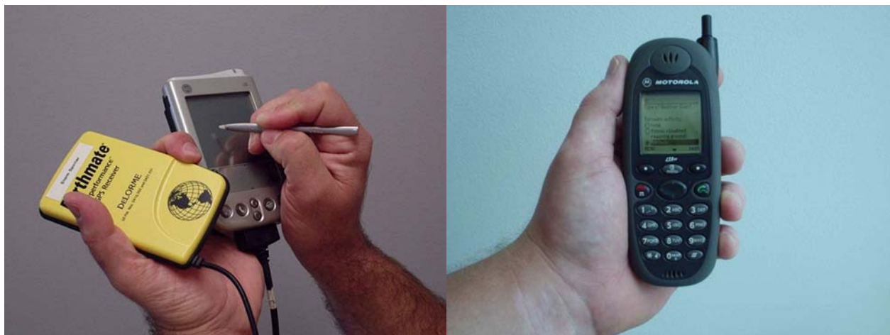
Figure 1: PDA with external GPS receiver and cell phone with integrated GPS receiver.

The prototype system utilizes platform-independent coding environments and open-source operating systems (Java and Linux) as the basis for the software components of the system. A generalized discussion of the programming approach used is included in this report. However, to encourage other developers to refine and extend the current prototype system, all of the open-source software code developed for this project can be freely downloaded from the prototype system web site ( skywarn.jimini.org ).